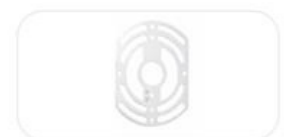
Mounting Fixing Hardware