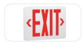
High Impact Thermoplastic Housing