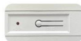
Test Switch and Charge Indicator