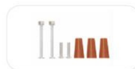
Screw and Cap

This fixture boasts a slim and solid design with universal mounting capability, ensuring versatile installation options. Its fire-resistant features enhance safety, while the emergency light built-in provides an added layer of security. Crafted with injection-molded thermoplastic ABS housing, the device combines durability with functionality. Additionally, the inclusion of a test switch and charge indicator further enhances user convenience and maintenance efficiency.